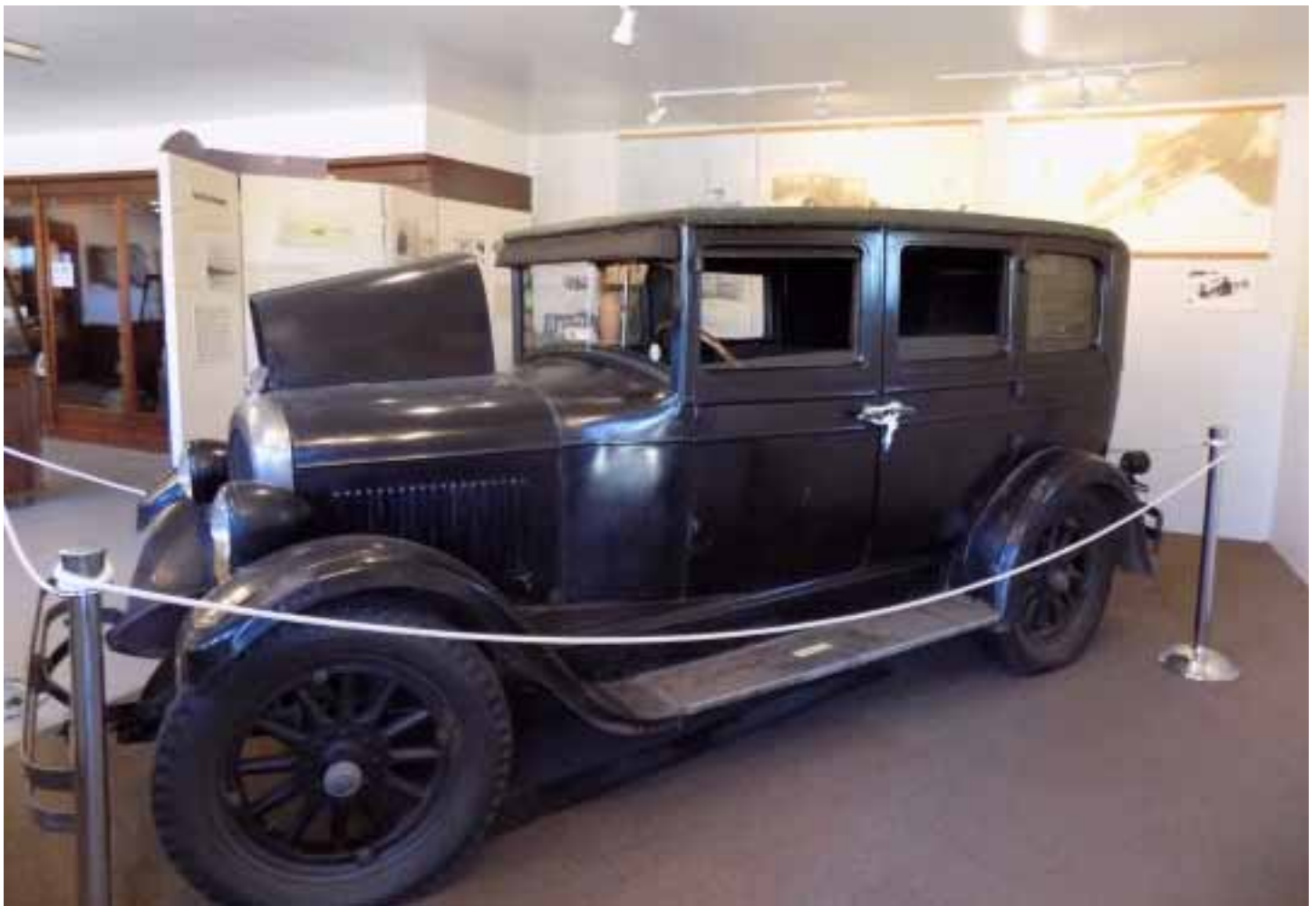
1926 CHRYSLER SHIPWRECK SURVIVOR AT EAGLE POINTE HARBOR MUSEUM