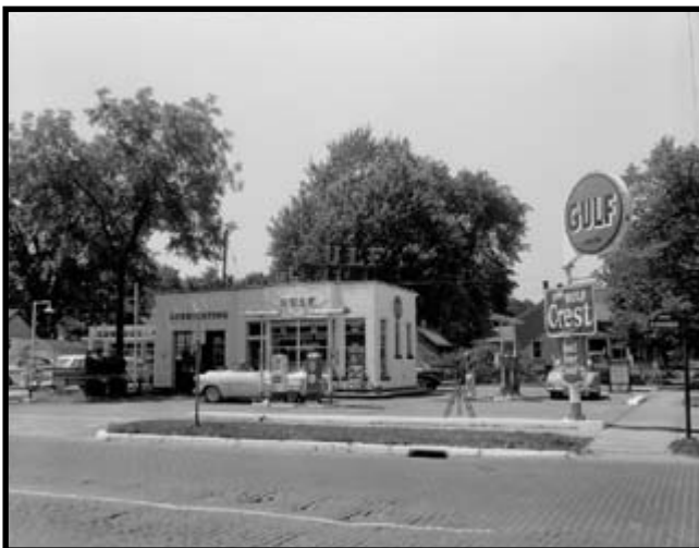
The late Ralph Bourner, longtime KAARC member, owned this Gulf Station on corner of Nazareth and East Main