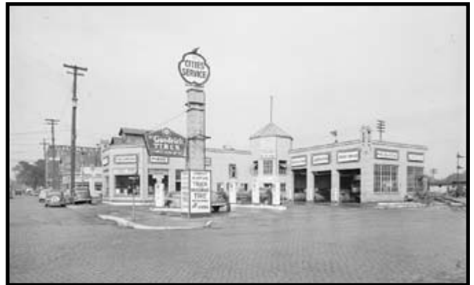
This building is still servicing auto repairs on Kalamazoo Avenue, near Porter St.