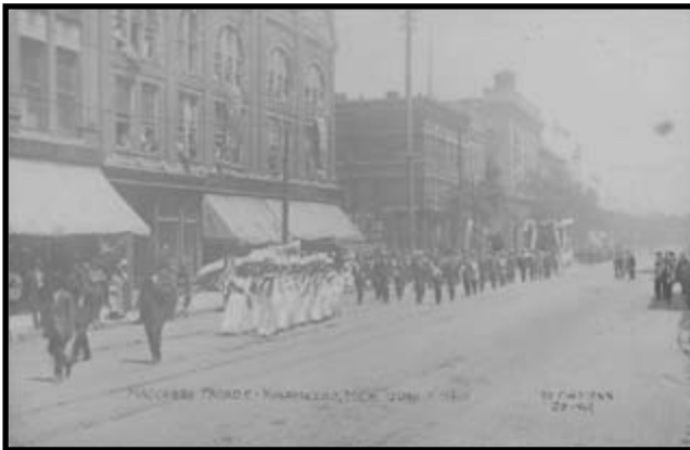
Maccabbee Parade in the early 1900's in Downtown Kalamazoo on a brick street

Warmer weather in Michigan means potholes in our streets. Turning off Oakland onto South on a recent afternoon, I noticed something that made me think, a large pothole with solid bricks at the bottom. As most long time Kalamazoo residents know, most of our downtown streets were originally brick that have been covered numerous times with asphalt. Pavement that has been patched every spring since they were paved 60+ years ago. Let's rip up all the asphalt and go back to brick streets. Bricks apparently allow the water from melted snow to drain away and not freeze and melt to cause cracks and potholes like water does with asphalt. Academy and other streets show that brick streets have problems with settling that causes undulating surfaces, but with a little improvement of the sand and gravel base, they should be level again. Once put back in decent shape, brick streets should far out last the asphalt. Bricks may even be a reasonable replacement for concrete. Brick streets would make another unique feature for our favorite town.