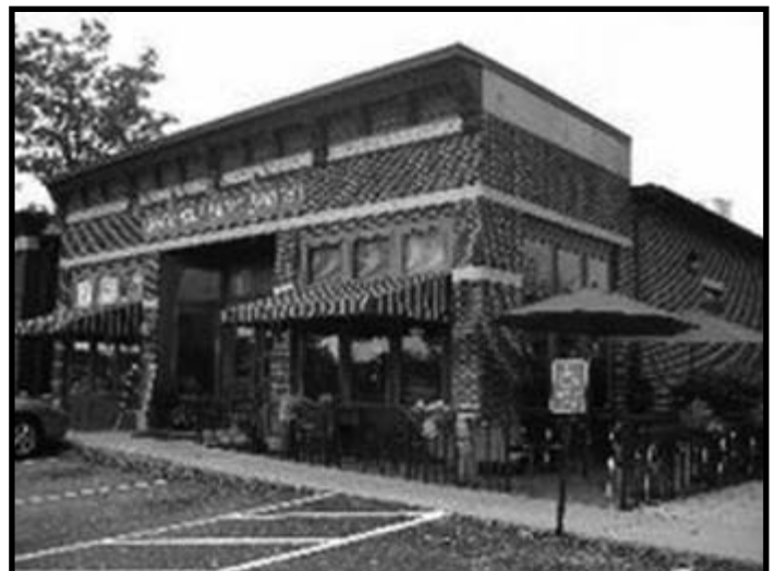
Recent photo of the MacKenzie Bakery near downtown Kalamazoo.